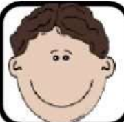
MARK - 7