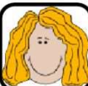
LYN - 18